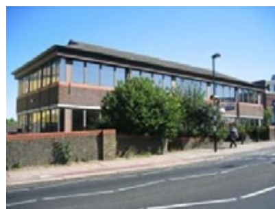
Front entrance from High Street

Follow the M3 onto the A316 (Signs for Central London/Richmond). Take the A312/A305 exit towards Heathrow/Kingston/Twickenham. At Apex Corner, take the 4th exit onto Hampton Road E/A312. Continue to follow the A312. Turn left onto Park Rd/A313 - continue to follow A313. Cross one roundabout. 2 High Street is on your right. For parking, continue and turn right into Station Road, and right again into Teddington Business Park, and park under the building.