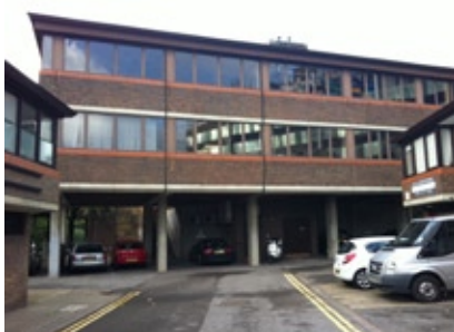
Rear entrance from Teddington Business Park

Exiting from Platform 2, turn left out of the station. Walk along Station Road approximately 50 meters. Turn left into Teddington Business Park. Turn right at the mini roundabout. Our office is in the large building at the end of the road. Walk under the building and up the stairs to the entrance.